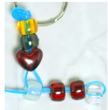
Steps 3 - 6