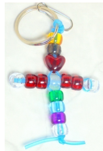
Finished #10 Crimson Heart Standard Salvation Cross