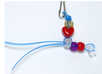
Steps 3 - 6