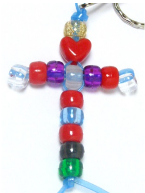
Finished #20 Red Heart Christmas Art Salvation Cross