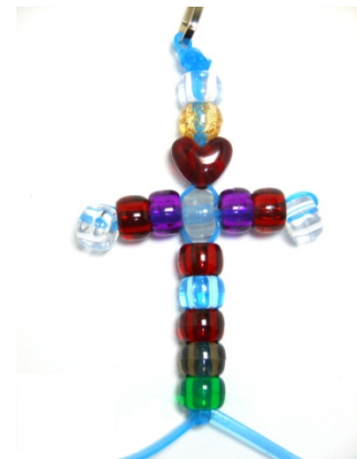
Finished Art Salvation Cross

Most importantly, take time to study the Scripture Card beforehand and review with your disciples either during the assembly or afterwards.