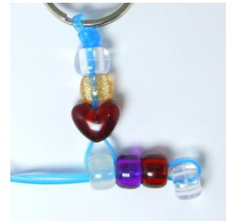
Steps 3 - 6